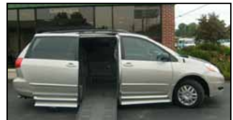
2009 Toyota Sienna LE. Braun Entervan side entry ramp, 10" lowered floor. Power kneel, door, and ramp. Multi-trac tie down attachment straps and lap belts. 800-420-6470. OCT V26