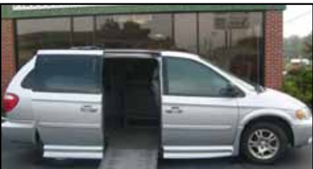
2004 Dodge Grand Caravan SXT. Braun Entervan Conversion with 8" lowered floor. Power kneel, ramp, and door. Removable driver and front passenger seat. 4 point tie downs, mounting plates and lap belts. Dark tinted glass, overhead console time/temp/compass. 800-420-6470 OCT V22