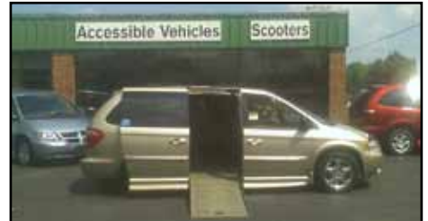
2002 Dodge Grand Caravan ES. Braun Entervan with 10 in. lowered floor, Power kneel, door, & ramp. Removable front seats with EZ Lock in both positions. Keyless ignition, low effort steering w/ backup. Electric park brake. Dark tinted glass, overhead console, AM FM Stereo Cassette and in dash 4 CD player. Call for a demo today! 800-420-6470 OCT V23