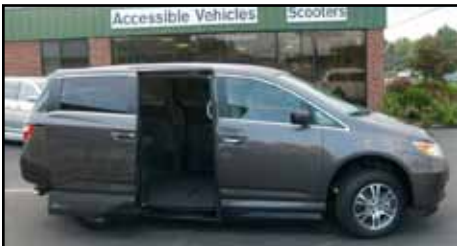
2011 Honda Odyssey EX. with VMI's Northstar In-Floor Ramp with Sure Deploy. Multi-trac tie down attachments, power kneel system and ramp deploy. Removable front driver/passenger seat. Multiple interior switches for door/ramp. Hard rubber mat flooring. Only 9 miles! Call to schedule a demo. 800-420-6470 OCT V28