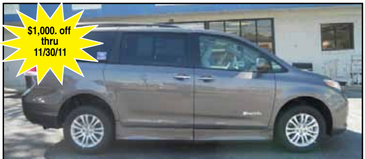
2011 Toyota Sienna w/ Braun Rampvan Conversion. Fully loaded 14" lowered floor, power fold-out ramp, door, & kneel system. Removable driver & passenger seats. Fold down foot rest. Custom ground effects. Interior switches, keyless entry & more. Call our sales department today 1-800-657-LIFT (5438) OCT V37