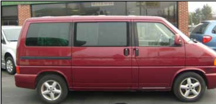
2002 VW Euro Van with Pic-A-Lift Swing Away Wheelchair Lift. 4 way restraints. Side sliding door. 39K Miles V-6 Auto Transmission. All power chassis with Sun Roof. 800-420-6470 OCT V4