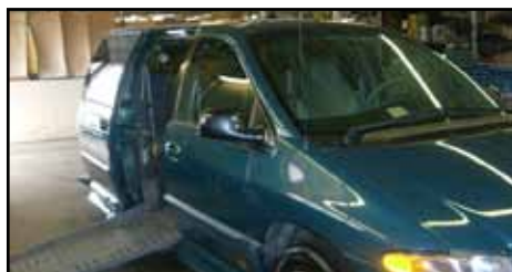
2000 Dodge Grand Caravan SE. Braun Entervan Conversion with a 10" lowered floor. Automatic side entry with power kneel, door, and ramp. 6 way drivers side transfer seat, removable front passenger seat. 4 way tie downs and lap belts. 800-420-6470 OCT V18