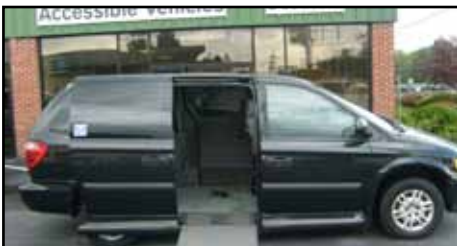
2005 Dodge Grand Caravan SXT/VMI Northstar Conversion. 10" lowered floor. Auto. kneel system, door, and ramp. Removable front passenger seat. 4 pt. tie downs w/ lap belts. 6 way driver transfer seat, with MPD Handcontrols. EZ Lock mid ship section. 800-420-6470 OCT V19