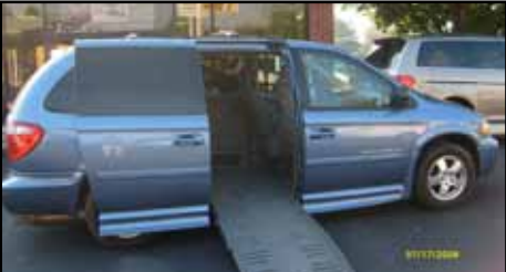
2007 Dodge Grand Caravan SXT. Braun Entervan conversion, remote entry, 10 in. lowered floor, power kneel, door, ramp. Removable driver and passenger seat. 4 way restraint system. 800-420-6470. OCT V25