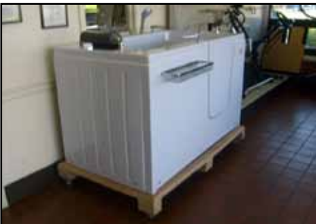
Walk In BathTub!*** Floor demo/As is: $2995. 1-800-420-6470. OCT M1