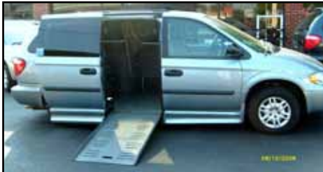
2005 Dodge Grand Caravan with Braun Rampvan Conversion, 10" lowered floor, power kneel, ramp, and door. Removable driver & front passenger seats. Multiple mounting plates and retractable tie downs. Fully automatic chassis. 540-932-7300 OCT V24