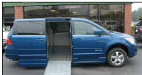
2011 Volkswagen Routan SE. W/ an American Wheelchair Conversion, 14" lowered floor. Power kneel, door, side entry ramp. Removable front driver/passenger seats. Multiple interior switches.. Fold/flip foot rest. 56" door height. 57 1/2" Inside height. Multi-trac tie down attachments, tie downs, and lap belts. 800-420-6470 OCT V27