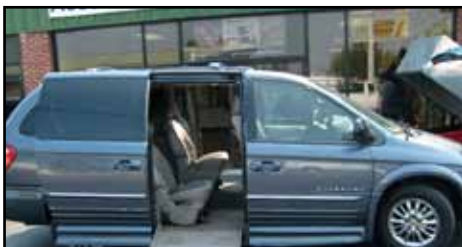
2002 Chrysler T & C Limited/Braun Entervan with 10" lowered floor, kneel system, power door, & ramp. Removable driver & front passenger seats. 4 pt. tie downs and lap belts. Remote entry. 800-420-6470 OCT V21