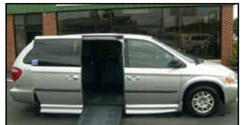
2002 Dodge Grand Caravan Sport. With Braun Entervan II Conversion, 8" lowered floor, Power kneel system, door, and ramp with hand held remote operation. Removable driver and front passenger seats. Multiple mounting strips, tie downs, and lap belts. 800-420-6470 OCT V20