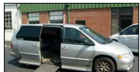
2000 Dodge Grand Caravan Sport. Braun Conversion, 8 in. lowered floor, remote entry, power door and ramp. 4 pt tie downs and lap belts. Shadow Gray exterior. Only 22K Miles. Dual ac & heat, overhead information console, time/temp compass. Warranty available. 800-420-6470 OCT V17