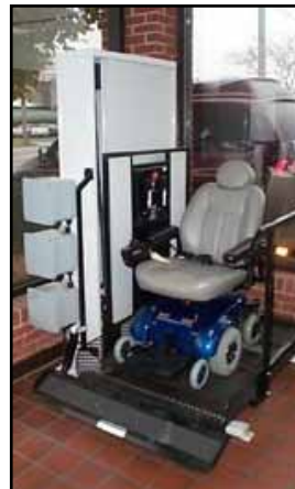
Trust-T-Lifts are designed to move physically challenged individuals from ground level to the main floor. Two styles to choose from. Used units in stock! 800-420-6470 OCT M6