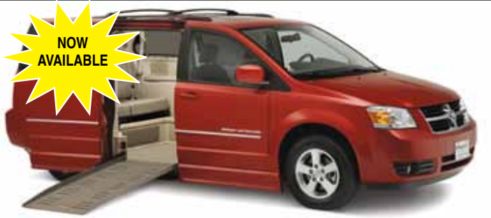
2011 Minivan with Braun Entervan side entry conversion (File photo) Call 1-800-420-6470 for complete details. OCT V32

E-Mail: mobility@ntelos.net Website: www.ilififestyles.net