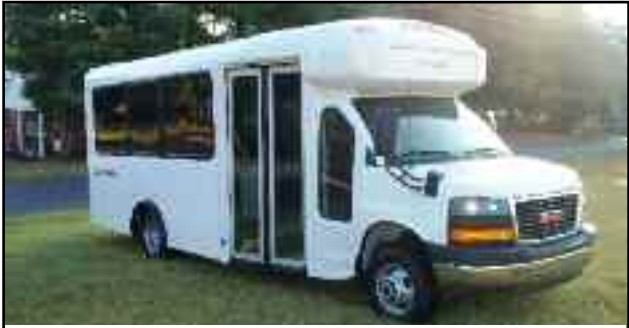
2008 GMC ARBOC low floor bus, Gas engine. Ramped entrance for wheelchairs. Air suspension. Driver, 13 passengers, 2 wheelchairs. 3,200 miles. Call Eugene for more details. JAN V36