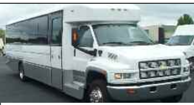
2007 Chevrolet C5500 General Coach Classic. 6.6 diesel engine. Driver, co-pilot, plus 34 passengers with overhead luggage. 10,000 demo miles. Call Eugene for pricing. JAN V38