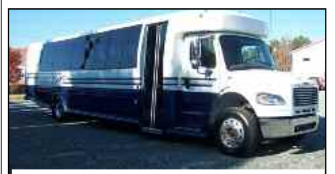
2008 Freightliner Turtletop FM2 Odyssey XL. Driver, co-pilot plus 37 passengers with overhead and rear luggage. 3,700 demo miles. Call Eugene for pricing. JAN V39