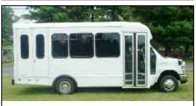
2009 Ford E 350 Starcraft Allstar. Driver plus 12 passengers and 2 wheelchairs. Gas engine. 1K Miles. Call Eugene for more details. JAN V40