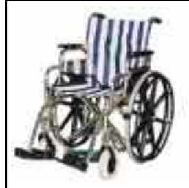
A q u a t i c wheelchair. The Stainless Steel Aquatic Wheelchair is easily collapsible for storage and features a flip-up arm for easy transfers, heavy duty

cross bracing for a 350 lbs weight capacity and mildew resistant PVC mesh. The chair is has a wide seat and is suitable for daily immersion and use in a pool environment. used for 1 year Paid $3000. $1500. 540-522-7411 JAN WC2