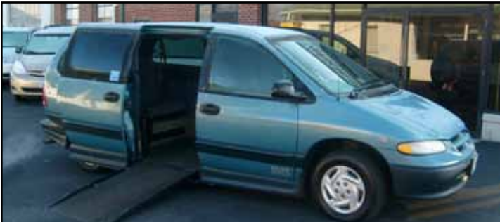
1996 Dodge Grand Caravan IMS Handicap Accessible Van Conversion. 8 in. lowered floor, 4 pt tie downs. Power door/ramp/kneel system. Removable passenger seat. Driver 6 way transfer seat. MPD handcontrols. On board trickle battery charger. 800-420-6470 AUG V9