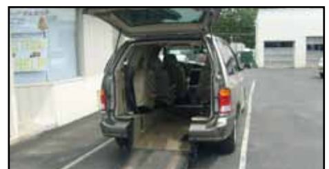
2003 Ford Windstar with Viewpoint Rear Entry Conversion. Power Kneel, Hatch, and Ramp. Mid Ship Remounted Bucket Seats. 4 Way Mounting Plates with Tie Downs and Lap Belts. Fully Automatic Chassis. 540-932-7650. AUG V37