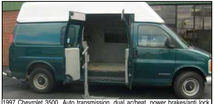
1997 Chevrolet 3500 Auto transmission, dual ac/heat, power brakes/anti lock. Power steering, tilt wheel. AM FM Stereo/Cassette. TV/VCR. Illuminated vanity mirrors. Sofa bed. 24" Raised Roof. Crow River Single Arm Lift. 800-420-6470 AUG V1