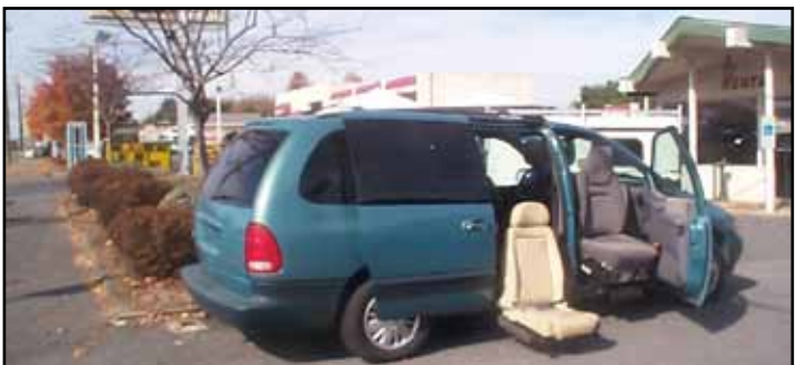
"M.I.T.S. HAS THE LATEST IN SEATING OPTIONS. 2075 W. MAIN ST. WAYNESBORO, VA. 1-800-420-6470. AUG V22