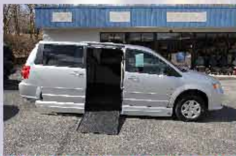
2012 Dodge Grand Caravan SE

Featuring Braun Millennium Lift with bus door entrance. Other features include: dual air & heat, tinted glass, and much more.