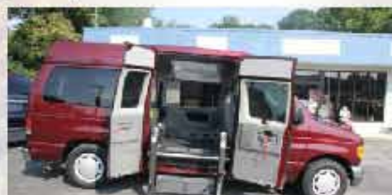
2005 Ford E-150

Featuring Braun Entervan with 10" Lowered Floor. Other features include: Removable driver and passenger seat, custom ground effects, dual air & heat w/rear controls, and much more.