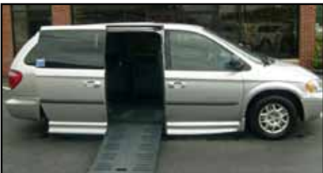
2002 Dodge Grand Caravan Sport. With Braun Entervan II Conversion, 8 in lowered floor, Power kneel/door/ramp with hand held remote operation. Removable driver and front passenger seats. Multiple mounting strips, tie downs, and lap belts. 800-420-6470 AUG V12