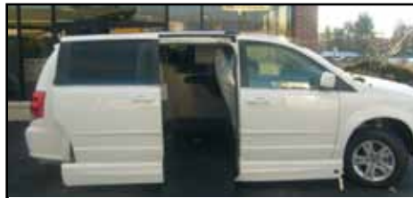
2011 Dodge Grand Caravan Crew featuring a VMI Northstar Conversion. 10 in. lowered floor, Auto. kneel, in-floor ramp, and side door. Removable driver and front passenger seats. 4 pt. tie downs and lap belts with multi mounting plates. 33 miles. Call for a demo today! 800-420-6470 AUG V17