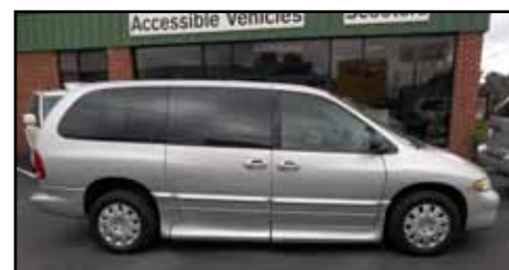
2000 Dodge Grand Caravan with VMI's Northstar Conversion: in floor ramp, 10" lowered floor, tie down mounting plates, Q Strains and lap belts. Removable driver and front passenger seats. 3mo/3k mi Drive train/Mobility warranty available for an additional charge. 800-420-6470 AUG V11