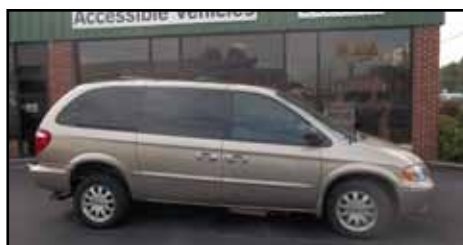
2002 Chrysler Town & Country EX Vision Rear Entry Conversion. 10" Lowered Floor, Power Kneel, Rear Hatch, Power Ramp. 4 Way Tie Down Mounting Plates, Tie Downs, and Lap Belts. Fully Auto Chassis. 70K Miles. 800-420-6470 AUG V36