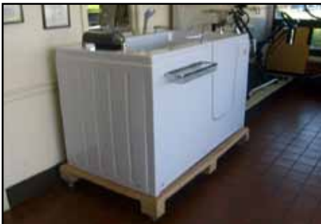
Walk In BathTub!*** Floor demo/As is: $2995. 1-800-420-6470. JUNE M10

EZ Lockdown System with Jazzy Lockdown Chair. $800.