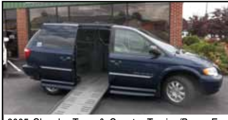
2005 Chrysler Town & Country Touring/Braun Entervan Conversion: 10" lowered floor, Power kneel system, door, and ramp. Removable driver/front passenger seat. Multi position tie down mounting plates. Dark tinted glass, DVD Entertainment package, Overhead console. 77K Mi. 800-420-6470 AUG V14