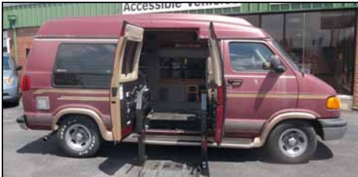
1998 Dodge Ram with a Braun Millennium L950SE. Raised Roof, Raised Doors, 56" Door Clearance, Power Side Door, Remote Entry. Front and rear air conditioning/heat. 5.2L V-8. Call 1-800-420-6470 for more details. AUG V2