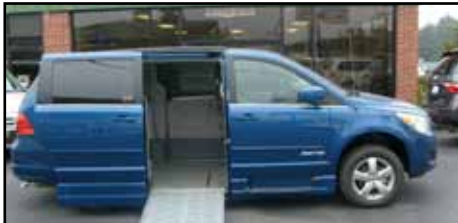
2011 Volkswagen Routan SE. W/ an American Wheelchair Conversion, 14" lowered floor. Power kneel, door, side entry ramp. Removable front driver/passenger seats. Multiple interior switches. Fold/flip foot rest. 56" door height. 57 1/2" Inside height. Multi-trac tie down attachments, tie downs, and lap belts. 800-420-6470 AUG V18