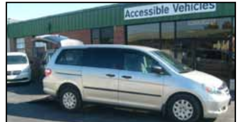
2007 Honda Odyssey EX. Vision Rear Entry Wheelchair Access. 4 way tie downs and lap belts. 2nd row remounted OEM bucket seats. Dual zone auto climate control AC. Rear air/heat controls. Dual sliding door w/ 2 end row power windows. 800-420-6470 AUG V16