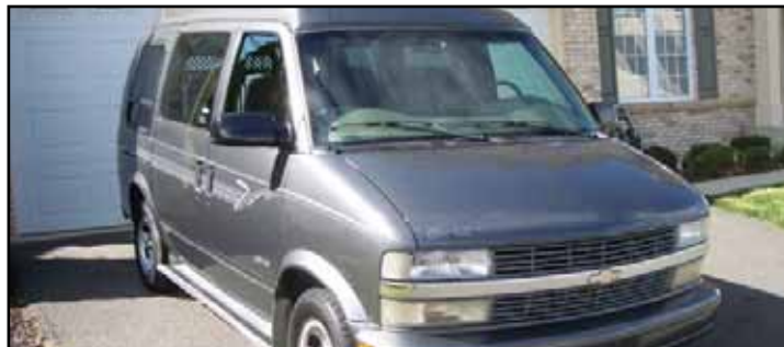
2000 Chevy Astro Mobility Van. 61k miles, 350 max wgt, new battery & fuel pump, AC & power locks not working, driver window sticks, PFL, PL, PSD, PW, RC, TV, VCP, PB, CC, Cass, AM/FM Radio, AC & 4TD, AS IS. $9,990. 571.255.0646 AUG V40