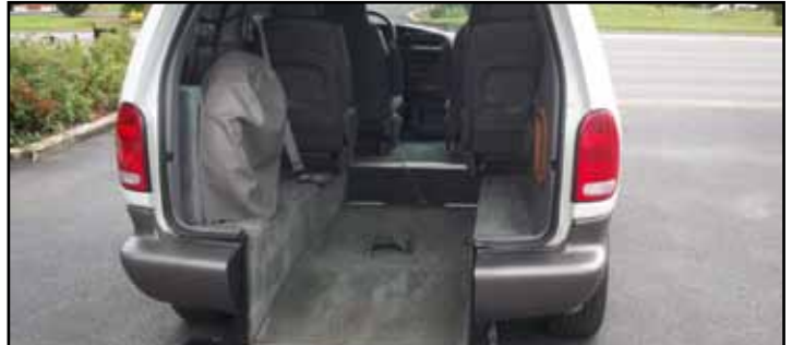
1997 Plymouth Grand Voyager Se/Viewpoint rear entry conversion. 8" drop floor, remounted mid-ship seats. Power rear hatch and ramp. EZ Lock and 4pt tie downs with lap belts. 68K Mi. 800-420-6470 AUG V8