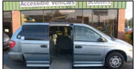
2005 Dodge Grand Caravan with Braun Rampvan Conversion, 10in lowered floor, power kneel, ramp, and door. Removable driver & front passenger seats. Multiple mounting plates and retractable tie downs. Fully automatic chassis. 540-932-7300 AUG V13