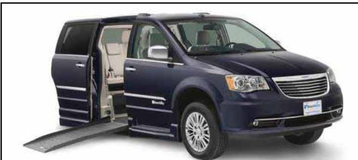
2012 Minivan with Braun Entervan side entry conversion (File photo) Call 1-800-420-6470 for complete details. AUG V39