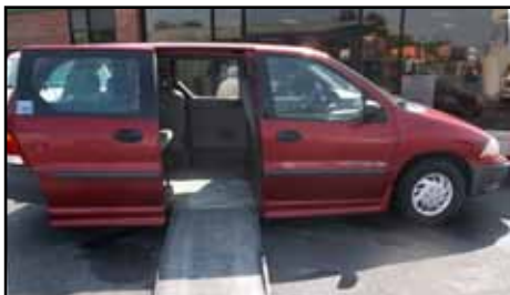
1999 Ford Windstar with an IMS side entry conversion. Lowered floor. Removable driver and front passenger seat. 4 point tie downs with lap belts. 800-420-6470 AUG V7

1995 Dodge Grand Caravan with Braun Entervan Side Entry Conversion. 10" lowered floor, removable driver & front passenger seats. Automatic sliding side door, ramp, kneel. External key switch entry. 4 way wheelchair restraints and lap belts. 540-932-7300