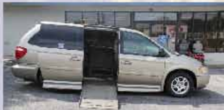
2004 Dodge Grand Caravan SXT

Purchase any used van now thru August 31, 2012 and receive a free set of Q-Strain Retractable Tie Downs.