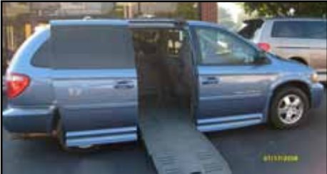
2007 Dodge Grand Caravan SXT. Braun Entervan conversion, remote entry, 10 in. lowered floor, power kneel, door, ramp. Removable driver and passenger seat. 4 way restraint system. 800-420-6470. AUG V15