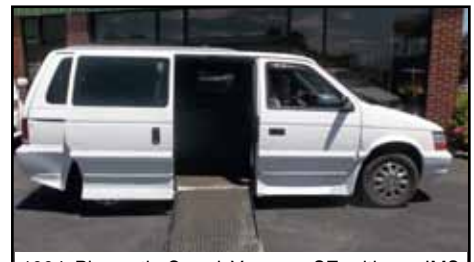
1994 Plymouth Grand Voyager SE with an IMS Rampvan conversion. 10" lowered floor, removable driver and front passenger seats. Automatic sliding door, kneel and ramp. External key switch entry. 4 pt. tie downs and lap belts. 540-932-7300 AUG V5