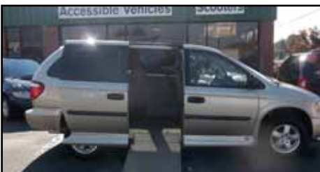
2005 Dodge Grand Caravan with VMI's Northstar Conversion. 10" Lowered Floor, Power Kneel Suspension, Side Sliding Door. Power In Floor Ramp. Removable Driver and Front Passenger Seats. 4 Point Tie Down Mounting Plates. Only 36K Miles. 800-420-6470. AUG V38