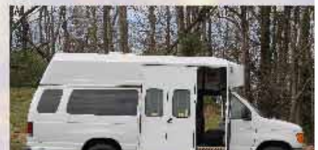
2006 Ford E-350

Featuring Braun Millennium Lift (Dual Post). Other features include: handheld pendant for lift operation, carpeting overhead lighting, and much more.