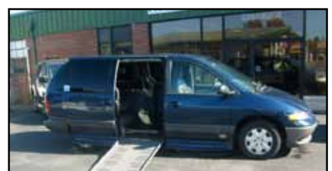
2000 Dodge Grand Caravan Sport. Braun Entervan conversion. Lowered floor, power sliding door, power kneel & power ramp. 800-420-6470 AUG V10