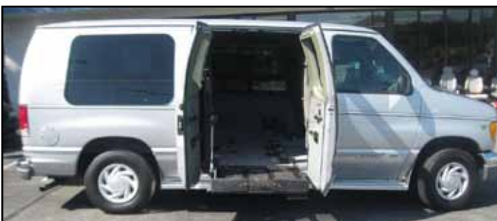
2001 Ford E 150 with a Braun Vangater II Lift. 6" lowered floor, Automatic doors with dash mounted, exterior magnetic, and hand held remote entry. 8 way driver transfer seat and EZ out passenger seat. 4 point tie downs and lap belts. Call 1-800-420-6470 for details. AUG V3