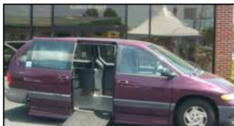
2000 Dodge Grand Caravan SE. with a Rollx Van Conversion. Power kneel, door, and ramp. 4 way restraints with multiple mounting plates. Removable front driver and passenger seat. 50K Miles. A warranty is available on this unit. 1-800-420-6470. SEPT V15