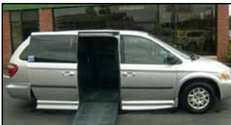
2002 Dodge Grand Caravan Sport. With Braun Entervan II Conversion, 8" lowered floor, Power kneel system, door, and ramp with hand held remote operation. Removable driver and front passenger seats. Multiple mounting strips, tie downs, and lap belts. 800-420-6470 SEPT V17