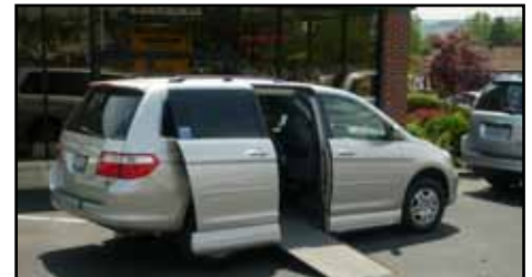
2007 Honda Odyssey EX/VMI Northstar Conversion. 10" lowered floor, kneel system, power door, and in floor ramp. Removable front seats. 4 pt. tie downs & multiple mounting plates. Magnetic and remote entry system. Multiple interior switches. 44K Mi. 800-420-6470 SEPT V25