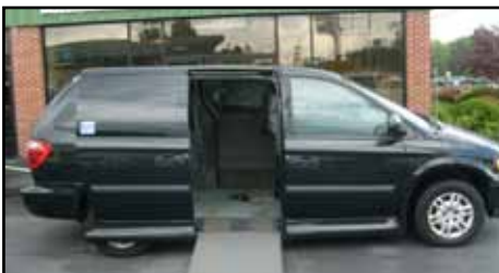
2005 Dodge Grand Caravan SXT/VMI Northstar Conversion. 10" lowered floor. Auto. kneel system, door, and ramp. Removable front passenger seat. 4 pt. tie downs w/ lap belts. 6 way driver transfer seat, with MPD Handcontrols. EZ Lock mid ship section. 800-420-6470 SEPT V16