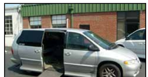
2000 Dodge Grand Caravan with VMI Conversion. Lowered floor, remote kneel, door, and ramp. Removable front passenger seat. Drivers 8 way power transfer seat. Hand controls. 4 way wheelchair restraint system and lap belts. 75K Mi. 800-420-6470 SEPT V14