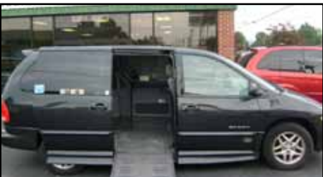
2002 Dodge Grand Caravan Sport. With Braun Entervan II Conversion, 8" lowered floor, Power kneel system, door, and ramp with hand held remote operation. Removable driver and front passenger seats. Multiple mounting strips, tie downs, and lap belts. 800-420-6470 SEPT V17