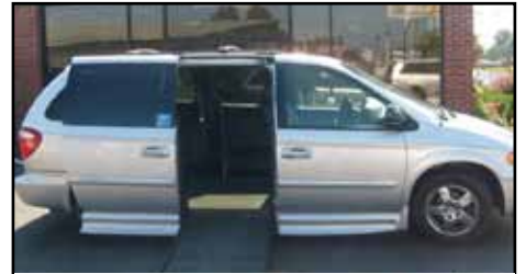
2003 Dodge Grand Caravan EX. with a Braun Entervan conversion including a 10" lowered floor, power kneel, door, and ramp. Keyless entry. Removable driver and front passenger seats. EZ Lock front passenger/driver positions. Low effort steering with back up. 800-420-6470 SEPT V21