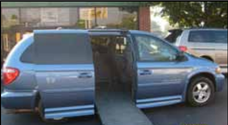
2007 Dodge Grand Caravan SXT. Braun Entervan conversion, remote entry, 10 in. lowered floor, power kneel, door, ramp. Removable driver and passenger seat. 4 way restraint system. 800-420-6470. SEPT V24