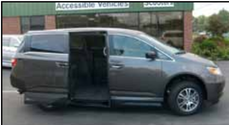
2011 Honda Odyssey EX. with VMI's Northstar In-Floor Ramp with Sure Deploy. Multi-trac tie down attachments, power kneel system and ramp deploy. Removable front driver/passenger seat. Multiple interior switches for door/ramp. Hard rubber mat flooring. Only 9 miles! Call schedule a demo. 800-420-6470 SEPT V27