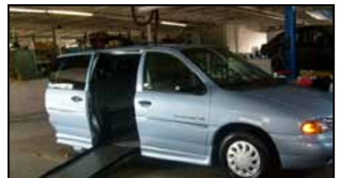
1998 Ford Windstar GL with an IMS Side Entry Automatic Ramp and Sliding Door. Multiple Tie Down Mounting Plates. Tie Downs and Lap Belts. Removable Driver and Front Passenger Seats. 800-420-6470 SEPT V42