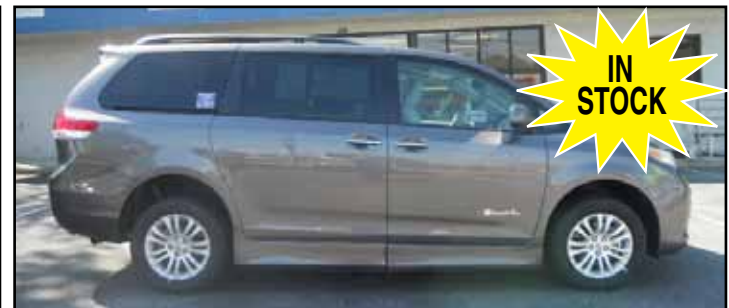
2011 Toyota Sienna w/ Braun Rampvan Conversion. Fully loaded 14" lowered floor, power fold-out ramp, door, & kneel system. Removable driver & passenger seats. Fold down foot rest. Custom ground effects. Interior switches, keyless entry & more. Call our sales department today 1-800-657-LIFT (5438) SEPT V46