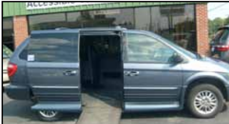
2002 Chrysler Town & Country Limited. VMI Northstar Conversion, with 10" lowered floor, power kneel, ramp, and door. Removable driver and front passenger seats. 4 way tie downs mounting plates. Electric park brake. 800-420-6470 SEPT V22