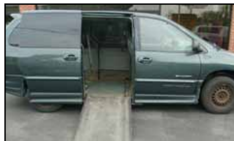
2000 Dodge Grand Caravan IMS Rampvan conversion with 10" lowered floor. Magnetic switches and exterior toggle switch for sliding door and ramp. Power ramp/sliding door. 4 way wheelchair restraints system. Call 540-932-7300. SEPT V10

2004 Chrysler T & C Touring with a Braun Entervan Conversion. 8" lowered floor. Power kneel, side door, and ramp. Removable driver and front passenger seats. 4 pt. tie downs and lap belts with multiple mounting plates. Push/pull hand control options for certified drivers. 1-800-420-6470 SEPT V7