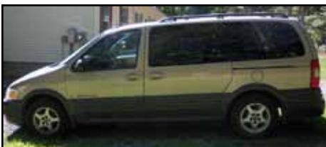
2003 Pontiac Montana Extended cab with Bruno Lift in rear. Remote keyless entry. Power doors. Onstar ready. And...Many other extras! Full disclosure and maintenance records. Well maintained. 154K Miles. 757-303-5005 SEPT V54