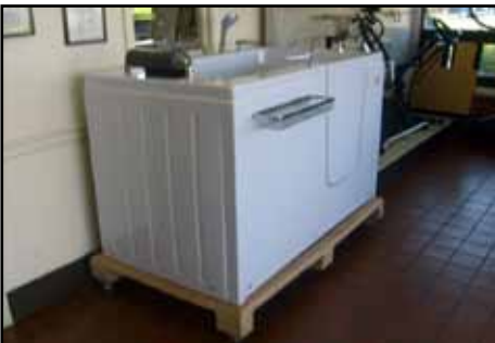
Walk In Bath Tub. Floor demo. AS IS: $2995. 1-800-420-6470 SEPT M6

M.I.T.S. HAS THE LATEST IN SEATING OPTIONS. 2075 W. MAIN ST. WAYNESBORO, VA. 1-800-420-6470. SEPT V29