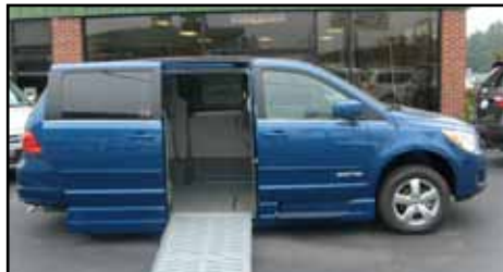
2011 Volkswagen Routan SE. W/ an American Wheelchair Conversion, 14" lowered floor. Power kneel, door, side entry ramp. Removable front driver/passenger seats. Multiple interior switches.. Fold/flip foot rest. 56" door height. 57 1/2" Inside height. Multi-trac tie down attachments, tie downs, and lap belts. 800-420-6470 SEPT V26