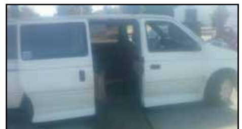
1993 Dodge Grand Caravan with Rollx Manual Conversion. Includes four point tie downs, 10 inch lowered floor, manual passenger side door, manual ramp. Removable front passenger and driver's seat. Call 1-800-420-6470 SEPT V8

2004 Chrysler T & C Touring with a Braun Entervan Conversion. 8" lowered floor. Power kneel, side door, and ramp. Removable driver and front passenger seats. 4 pt. tie downs and lap belts with multiple mounting plates. Push/pull hand control options for certified drivers. 1-800-420-6470 SEPT V7