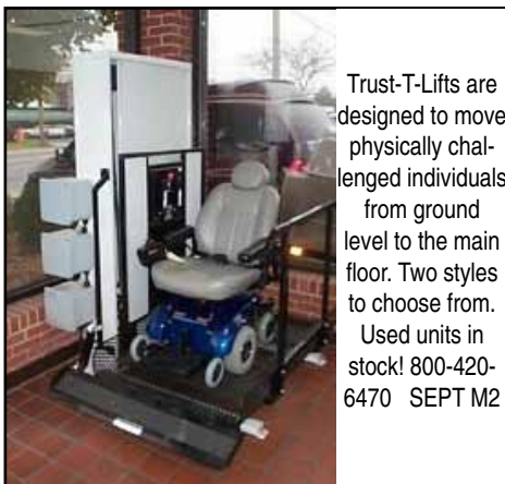
Trust-T-Lifts are designed to move physically challenged individuals from ground level to the main floor. Two styles to choose from. Used units in stock! 800-420-6470 SEPT M2