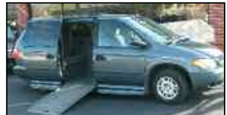
2006 Dodge Grand Caravan/Braun Conversion. 10 in. lowered floor, remote door, kneel, and ramp. 4 pt. tie downs. Removable driver & front passenger seats. Stow and Go Rear Storage. Loaded Chassis! 800-420-6470 DEC V18