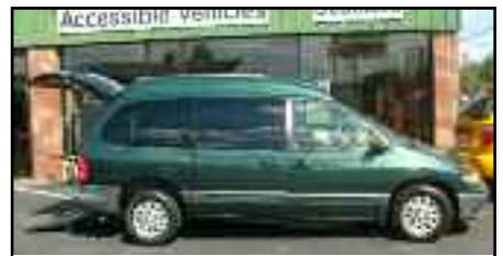
1999 Dodge Grand Caravan. Viewpoint rear entry conversion with key FOB. Sliding side doors. Passenger side transfer seat. Raised roof. TV/VCR, illuminated vanity mirrors. Warranty available for an additional charge with the purchase of this vehicle. 540-932-7620 DEC V15