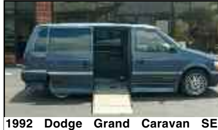
1992 Dodge Grand Caravan SE. Braun Conversion, 4 pt tie downs, 10 inch lowered floor, power sliding door, removable driver & front passenger seats. Call 1-800-420-6470 for more information. DEC V39