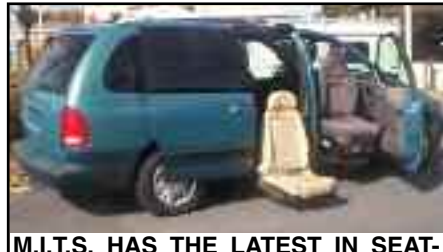
M.I.T.S. HAS THE LATEST IN SEATING OPTIONS. STOP BY FOR A DEMO TODAY! 2075 W. MAIN ST. WAYNESBORO, VA. 1-800-420-6470. DEC V34