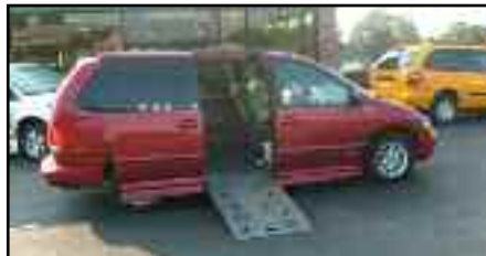
2000 Chrysler Town and Country Lx. Braun side entry, 8 in. lowered floor conversion. Power kneel, door, and ramp. Removable passenger seat. Driver transfer seat, hand controls. Loaded fully auto. chassis. 3 Mo./3,000 Mi. 800-420-6470 DEC V10