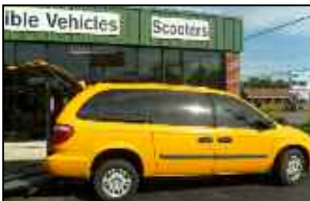
2005 Dodge Grand Caravan SE. Manual rear entry ramp. 10 inch lowered floor. 4 pt. tie downs and lap belts. ADA COMPLIANT!!! 800-420-6470 DEC V13