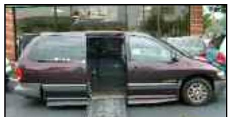
1996 Plymouth Grand Voyager with a Braun Entervan conversion. Includes 8 in lowered floor, 4 pt. tie downs, power door, ramp, and kneel system. Removable driver/passenger seats. Warranty available. 69K Mi. 800-420-6470 DEC V12