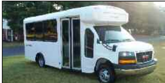
2008 GMC ARBOC low floor bus, Gas engine. Ramped entrance for wheelchairs. Air suspension. Driver, 13 passengers, 2 wheelchairs. 3,200 miles. Call Eugene for more details. DEC V42