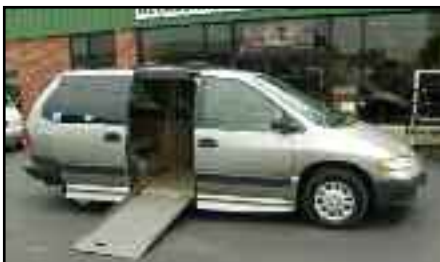
1996 Dodge Grand Caravan SE. Braun Entervan Conversion. 8 in. Lowered floor, power kneel and ramp. Removable passenger seat, 6 way driver transfer seat. 800-420-6470. DEC V8