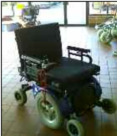
Pride Jazzy 1420. Quantum power chair. Sy Energy seat for 450 lbs. 23 in wide seat. 800-420-6470 DEC WC1