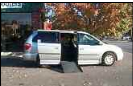
2002 Dodge Grand Caravan Sport. Keyless entry. Braun Entervan Conversion, lowered floor, power kneel, door & ramp, removable driver & front passenger seats. Limited Warranty. 1-800-420-6470. DEC V14