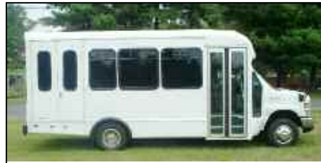
2009 Ford E 350 Starcraft Allstar. Driver plus 12 passengers and 2 wheelchairs. Gas engine. 1K Miles. Call Eugene for more details. DEC V46