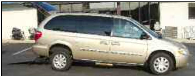
2007 Chrysler Town & Country LX; Champagne; only 1700 miles; VISION Manual Rear-entry Conversion; 10" dropped full-cut floor; 4 pt. tiedowns; Lightweight spring-hinged manual folding ramp; Pwr hatch release/close; flip down rear bench seat; modified mid-ship seating; still has remaining Factory Warranty! Call for more details 434-846-7510 STOCK# 366 $36,995. DEC V48