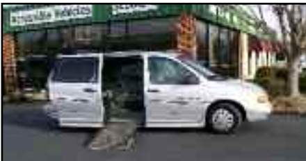
1998 Ford Windstar Extended Sport. IMS Ramp Van. Side Entry Lowered Floor, Kneel System, Manual Door and Ramp. EZ Lock and 4 Pt. Tie Downs with Seat Belts. 3 Mo./3K Mile Limited Warranty. 800-420-6470 DEC V11