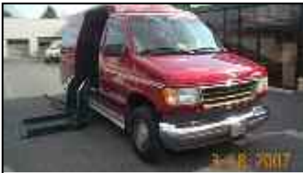
1995 Ford E 150. Ricon Lift, Raised Power Side Door, Raised Roof & Lowered Floor. Removable Driver Seat. EZ Lock. $16,500. (540) 932-7300. DEC V2