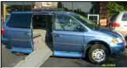
2007 Dodge Grand Caravan SE. VMI Northstar in floor ramp conversion. Lowered floor, 4 way tie downs, Remote entry with power door and kneel. Removable driver and front passenger seats. Remainder of factory warranty plus 3 yr./36K Mi. VMI Warranty. 800-420-6470. DEC V23