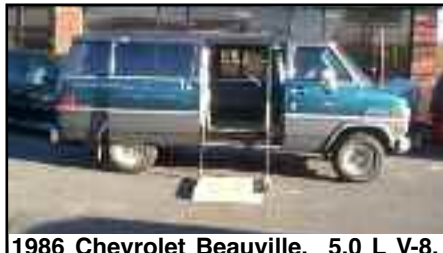
1986 Chevrolet Beauville. 5.0 L V-8. Auto. transmission, power brakes, power steering. Large cargo area in rear. Braun Lift. 800-420-6470 DEC V1