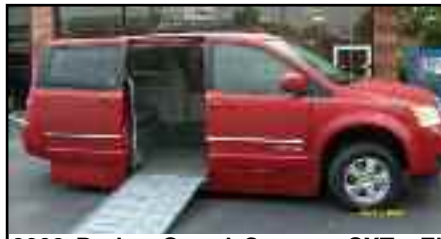
2008 Dodge Grand Caravan SXT. El Dorado American conversion with remote entry, 12 in. lowered floor, ADA 56 in door height, power side door, ramp, and kneel. Removable front seat. Loaded chassis with many extras. 800-420-6470 DEC V22