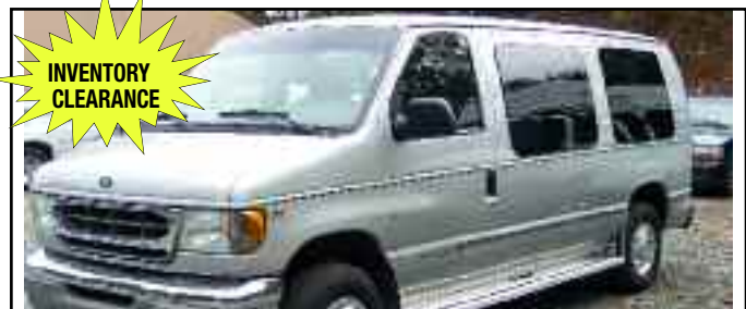
2001 Ford E-150; Silver; 72k miles; Self-driver; Braun Vangater full pwr lift; Hand Ctrls; Steering knob; m6-way pwr transfer seat; 6" lowered floor full cut; removable pass. seat; magnetic entry; 4 pt. tiedowns; $24,900 Please call 800-657-5438 for more info. STOCK# 52-0406 DEC V49