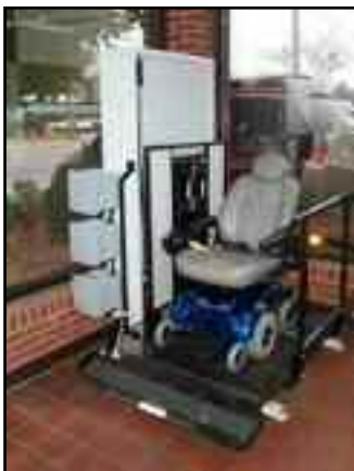
Trust-T-Lifts are designed to move physically challenged individuals from ground level to the main floor. Two styles to choose from. Used units in stock! 800-420-6470 DEC M1