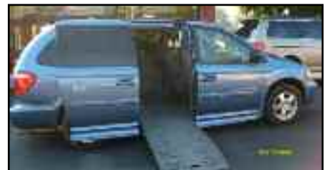
2007 Dodge Grand Caravan SXT. Braun Entervan conversion, remote entry, 10 in. lowered floor, power kneel, door, ramp. Removable driver and passenger seat. 4 way restraint system. 800-420-6470. DEC V21