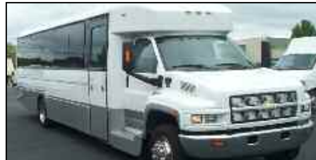
2007 Chevrolet C5500 General Coach Classic. 6.6 diesel engine. Driver, co-pilot, plus 34 passengers with overhead luggage. 10,000 demo miles. Call Eugene for pricing. DEC V44