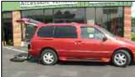
2002 Nissan Quest with Tracker Platform Lift (remote engaged). 68K Mi. DVD, Am/Fm Stereo with multi disc CD player. Tinted Windows. Power Mirrors, Windows, and Door Locks. 540-932-7300 DEC V32