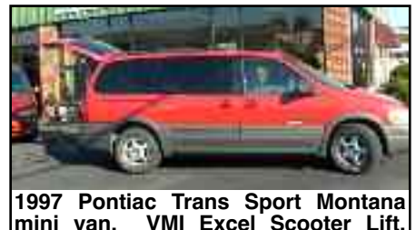
1997 Pontiac Trans Sport Montana mini van. VMI Excel Scooter Lift. MPD Hand Controls. Auto. trans, Power mirrors, windows, door locks. Cruise control, Rear wipers/Defroster, Tinted windows, Overhead console time/temp/compass. Am/Fm Stereo, Cassette. 77 K MI. 800-420-6470 DEC V31