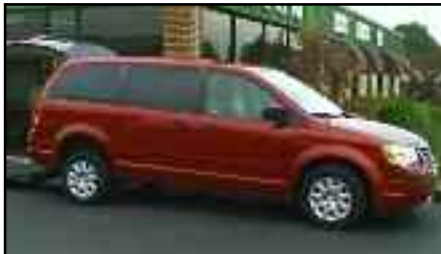
2008 Chrysler Town & Country LE. Freedom rear entry manual conversion. 4 pt. tie downs and lap belt. Dual middle jump seats. 42 K Mi. 800-420-6470. DEC V20