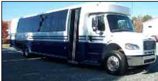
2008 Freightliner Turtletop FM2 Odyssey XL. Driver, co-pilot plus 37 passengers with overhead and rear luggage. 3,700 demo miles. Call Eugene for pricing. DEC V45