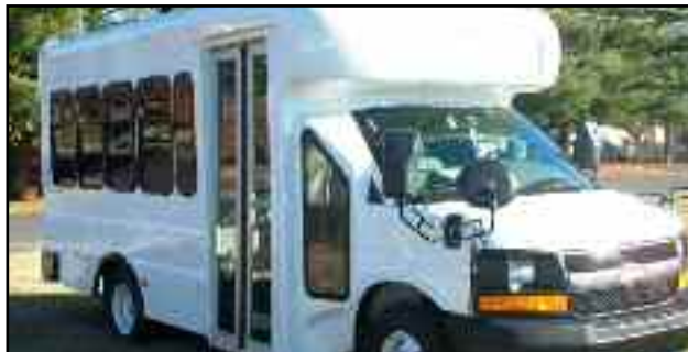
2008 Chevrolet 3500 Supreme Star Trans Senator SII (MFSAB). Gas engine, Driver plus 14 passengers. Call Eugene for pricing and more information. DEC V43