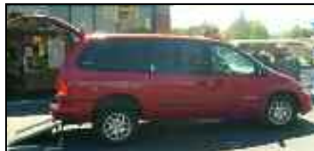
2000 Dodge Grand Caravan Sport with Freedom Kneelvan Conversion. Power rear entry ramp, power kneel, half cut 10 in. lowered floor. EZ Lock and 4 pt. tie downs. 48K Mi. 3 Mo./3,000 Mi. Mobility Equipment/Powertrain warranty. 800-420-6470 DEC V16