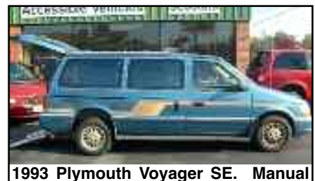
1993 Plymouth Voyager SE. Manual rear entry, fold down rear ramp, fold down back bench seat. 4 pt. tie downs. Power brakes, steering, door locks, and mirrors. AM/FM Stereo/CD. Tilt steering, heat & AC. Cruise Control. 800-420-6470 DEC V7