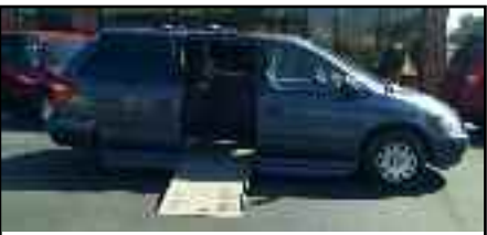
2001 Chrysler Town & Country LX. w/ dual ac & heat, power brakes, steering, windows, mirrors, door locks. Tilt and cruise. Keyless entry. Braun Entervan II conversion, 10 in. lowered floor, power kneel, door and ramp. Removable driver and front passenger seats. 4pt. tie downs and lap belts. 55K Mi. 800-420-6470 DEC V17