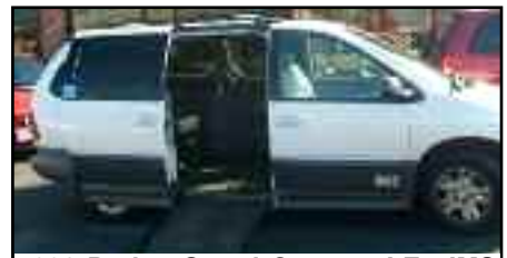
1996 Dodge Grand Caravan LE. IMS Side Entry, 10 in. lowered floor conversion. Power door, kneel, and ramp with keyless entry. 4 pt. tie downs. Driver side transfer seat and removable passenger seat. Tinted windows, overhead console. 800-420-6470 DEC V9