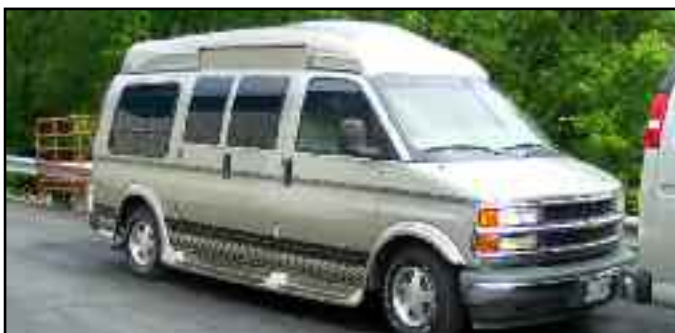
2000 Chevrolet Express 1500; Fullsize; 31k miles; Light pewter; Full Power Lift; Raised Roof & Raised Door Panels; Carpeted; 4 Point Tiedowns; 434-846-7510 STOCK# 266 $27,900. DEC V50