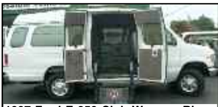
1997 Ford E 350 Club Wagon. Ricon S Series walk thru lift. 4 in. midship drop floor, removable front driver seat, tie down plates and retractable tie downs. Anti skid floor wheelchair area. 8 in. raised door panels, 63 in. entrance height. 12 in. raised roof and 68 in. head room height. 540-943-3430 DEC V29