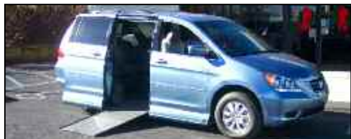
NEW 2009 Honda Odyssey Ex; VMI Northstar; Ocean Mist; 7 miles; Power In-floor Ramp, Door & Kneel System; 10 in Low Floor; Removable Driver & Passenger Seats; Remote Entry; 4 Point Safety Restraints; $54,995.00; Call 800-657-5438 for more details DEC V51