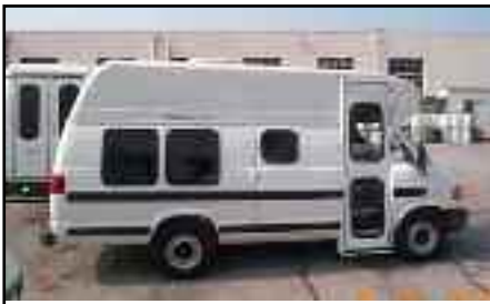
2001 Dodge Ram 3500. Dual a/c & heat, power brakes, power steering, tilt steering wheel, 3 single seats, 3/2 person seats, bus door opener. Not an accessible vehicle. 540-943-3430. DEC V33