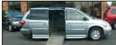
2006 Chrysler Town and Country Touring. Braun Entervan conversion featuring a 10 in. lowered floor, power kneel, door, and ramp. Removable driver/front passenger seats. EZ lock in front passenger position. 4 pt. tie downs/lap belts w/ multi/ positions. 12M/12K Mi. Exclusive MITS of VA Warranty. 800-420-6470 DEC V19